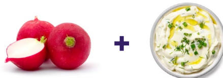
Radishes + labneh