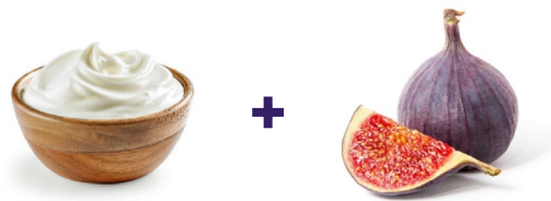
Plain Greek yogurt + fresh figs

If you're craving a snack, check in with your body. Are you low on energy? Is your stomach empty? Avoid eating when you're bored or stressed. Instead, save snacking for when you need extra fuel to make it to the next meal.