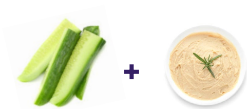
Cucumber + hummus