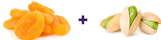
Dried apricots + pistachios