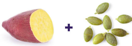
½ baked sweet potato + pumpkin seeds