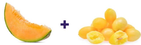
Melon + ginkgo nuts