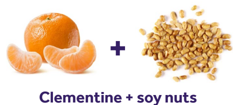
Clementine + soy nuts