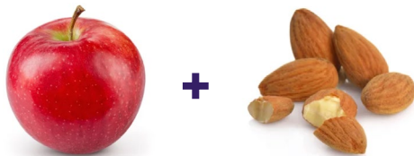
Apple + almonds