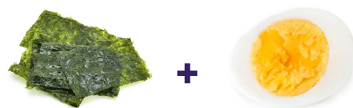
Roasted seaweed + hard-boiled egg

If you're craving a snack, check in with your body. Are you low on energy? Is your stomach empty? Avoid eating when you're bored or stressed. Instead, save snacking for when you need extra fuel to make it to the next meal.